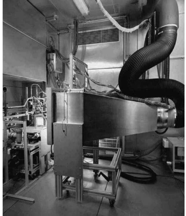
Typical System Configuration:

This configuration allows the test staff to have access to any test cell from any control PC (over Ethernet). To allow seamless integration to the test cell software, a special data format was created that allows data to be read by the OPC server, so that the set up of the system is handled automatically.